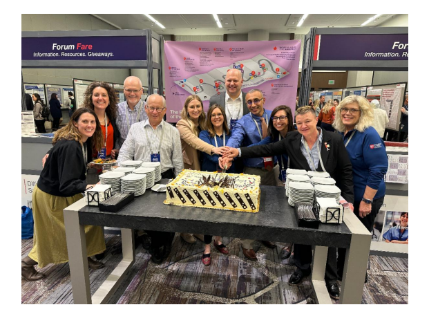
Anticoagulation Forum Centers of Excellence celebrates their 10th Anniversary with a cake cutting!